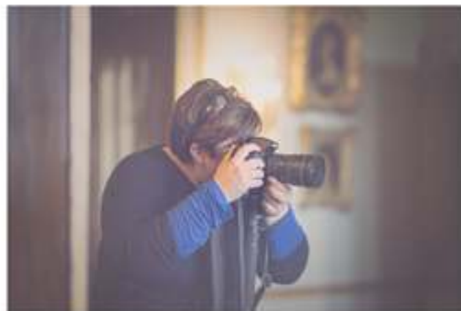
captured at Samerley House Ringwood